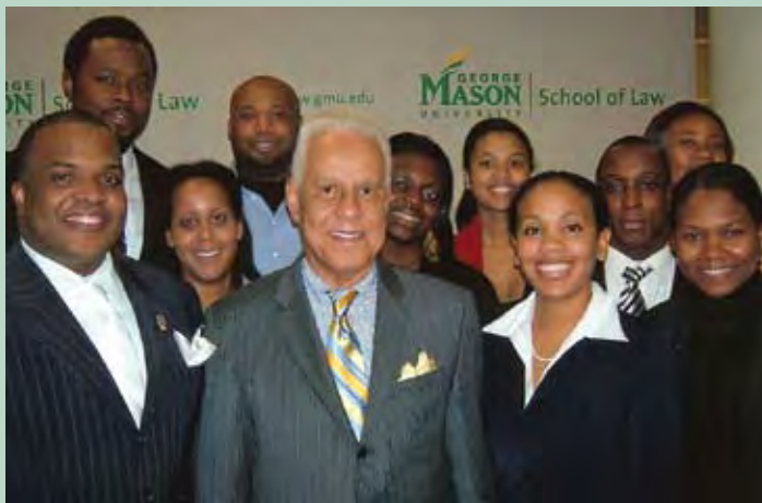
L. Douglas Wilder, mayor of Richmond and former governor of Virginia, poses with members of Mason Law's Black Law Students Association, now celebrating its 20 th anniversary at the law school.

Do you have a BLSA story to tell? Alumni are encouraged to share their memories of BLSA membership in honor of the chapter's 20 th anniversary. Please send your comments to lawalum@gmu.edu or call 703-993-8112.